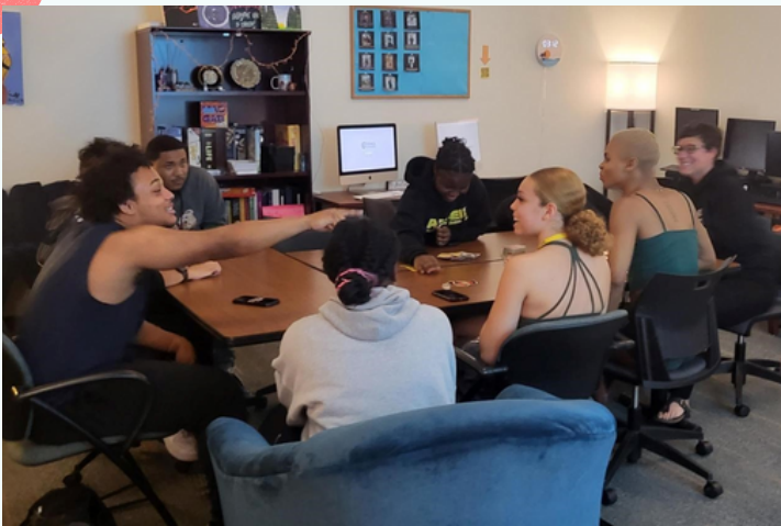
Summer Bridge '23

Be gentle & kind to yourself. You are your biggest supporter. I hope everyone has a great Fall semester!