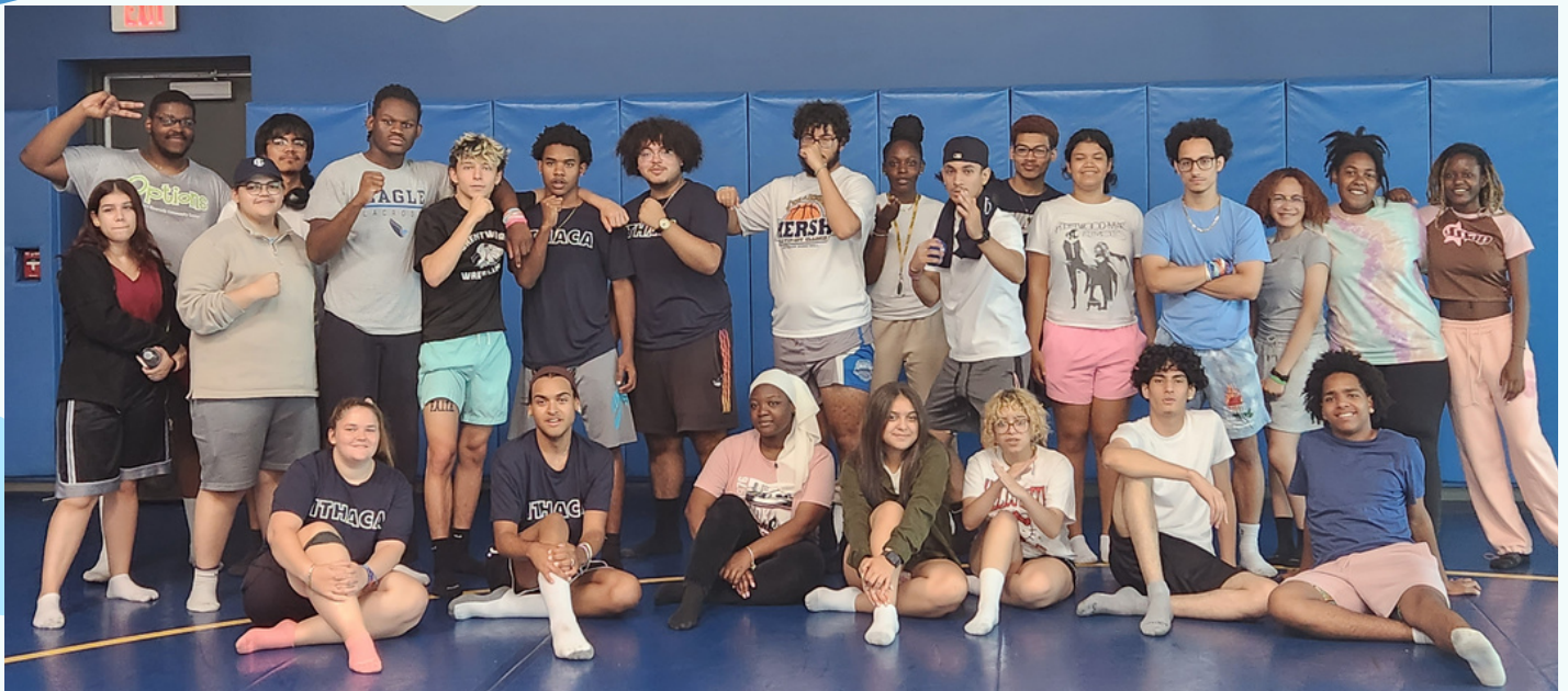
Summer Institute '23