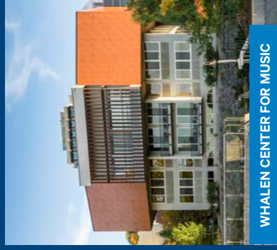
WHALEN CENTER FOR MUSIC