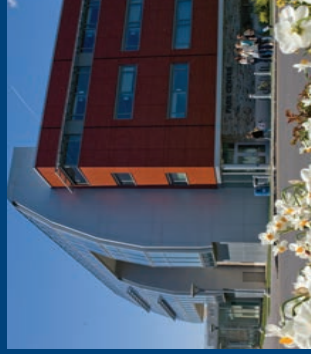
CENTER FOR BUSINESS AND SUSTAINABLE ENTERPRISE

No parking passes are required for the weekend.