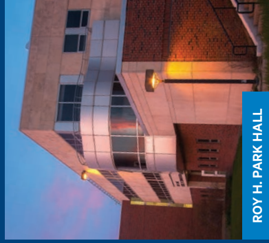
ROY H. PARK HALL