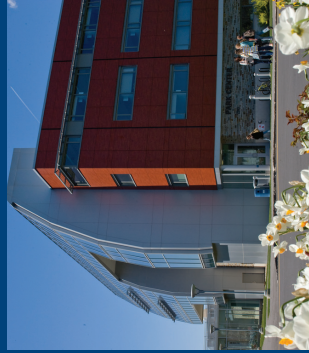
CENTER FOR BUSINESS AND SUSTAINABLE ENTERPRISE

No parking passes are required for the weekend.