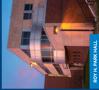
ROY H. PARK HALL