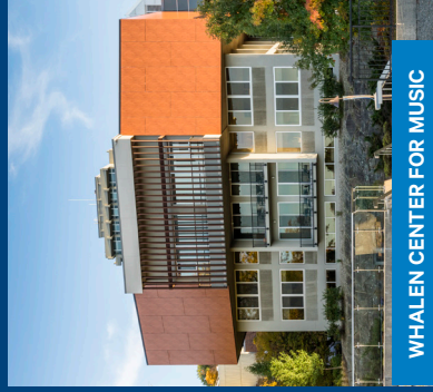
WHALEN CENTER FOR MUSIC