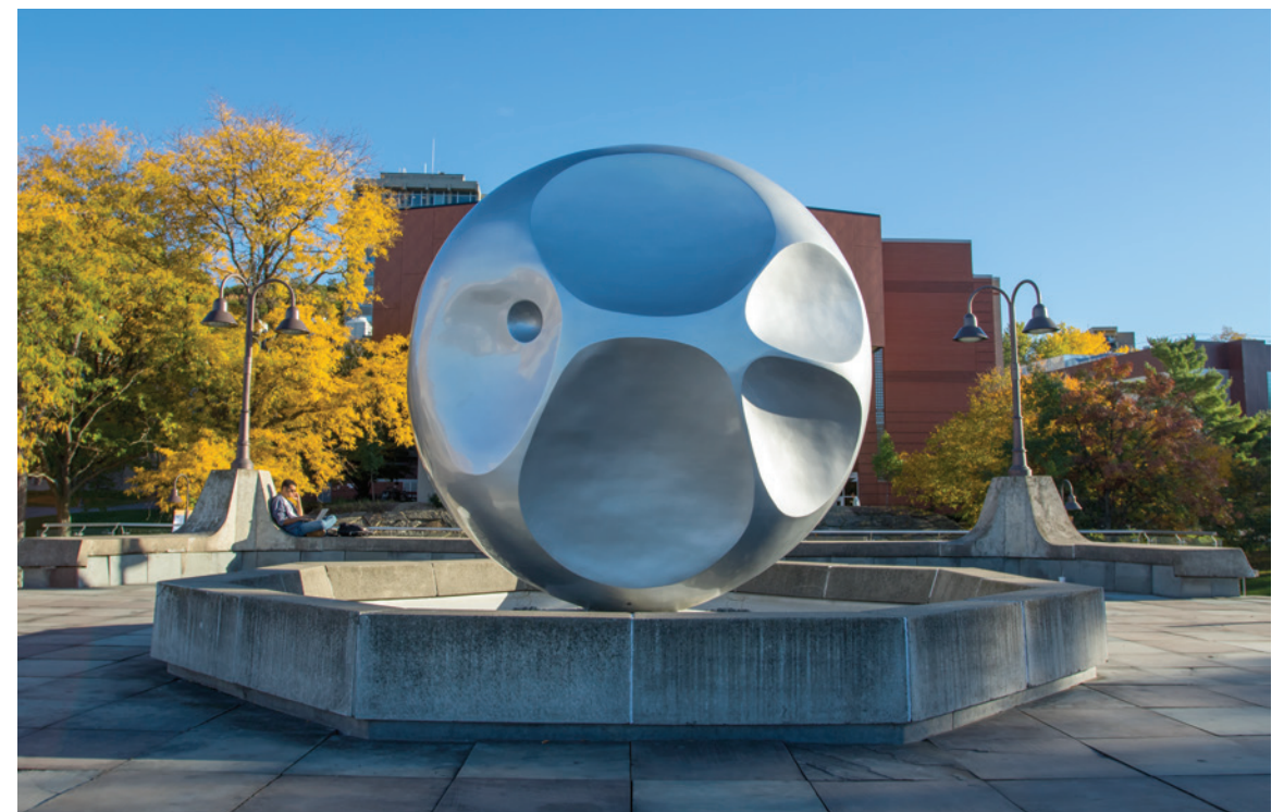
▲ Get to know campus landmarks and all the best study spots.