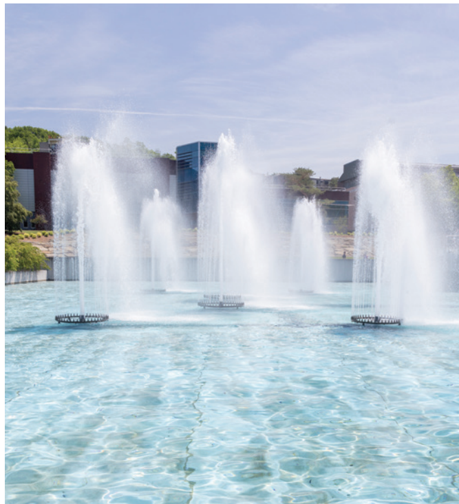
▲ Take photos in front of the fountain.